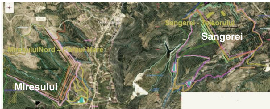
Fig. 1. Location of the alternatives

Based on in site studies and design requirements two alternatives were selected [5]. Thei locations are shown in figure 1.