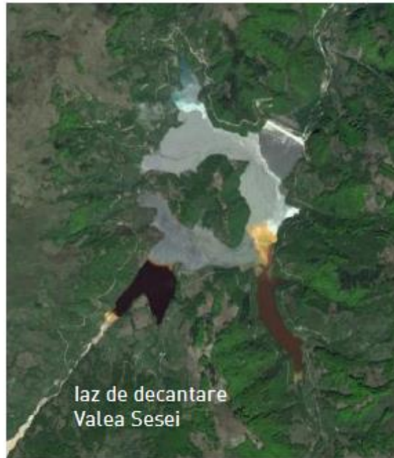
Fig. 4 Tailings ponds from Valea Sesei