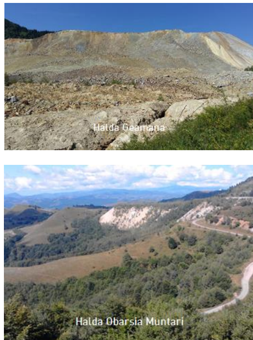
Fig. 3. Geamana dumping perimeter and Valea Muntari.

Analysing the mining perimeters within Cuprumin company we established that the dumps are mainly made up of sedimentary and volcanic rocks comprised of Fundoia and Poieni andesite impacted by hypogenic alteration and mineralization with various degrees and intensities. Tailings stored in ponds come from stripping deposits and is primarily made up of a mix of andesite, altered or disaggregated but also relatively fresh and compact, cretaceous sedimentary rocks with varied resistance properties as well as tailings with high clay content coming from surface areas and clay seams of cretaceous rocks.