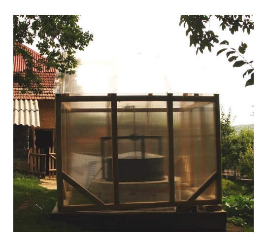
Fig. 4. Household biogas unit in operation in Boteni village, Argeş.

The applicative research carried out under national and bilateral cooperation projects has un essential role in the institute research framework. Thus, a biogas system intended to treat domestic waste has been designed and implemented in rural areas. The biogas unit is designed and built mainly for treatment and energy recovery of biodegradable waste generated in small farms but also for local municipalities to recovery various organic waste such as algae and other biodegradable waste generated in wetlands. Figure 4 shows the 4mc biogas unit built in Boteni, Argeş [11].