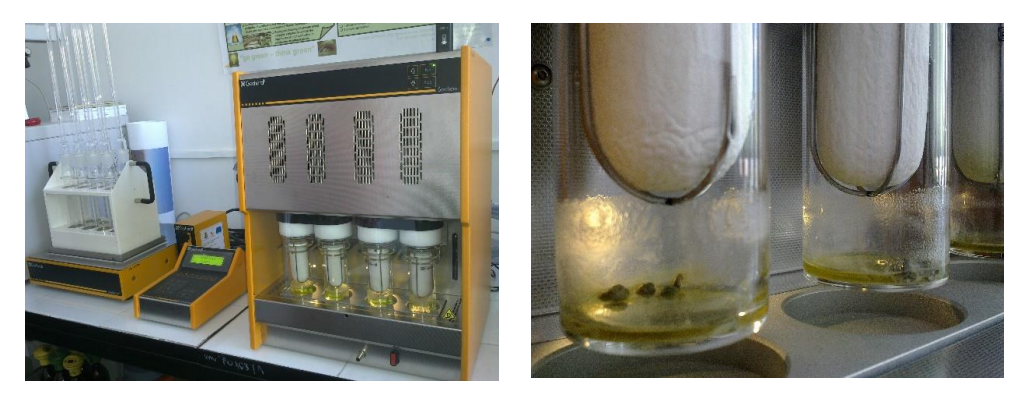
Fig. 2, a . Gerhardt Soxhlet fat extractor used for laboratory research.

For the quantitative determination of the fat content in biomass, a Gerhardt Soxtherm fat extractor has been used for the extraction in two steps followed by a subsequent gravimetric determination. Figure 2a and 2 b show the vegetal oil extracted from dry biomass in laboratry experiments by using a Gerhardt Soxtherm fat extractor.