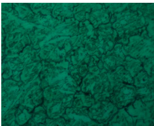
Fig. 4. Metallographic structure of deposited metal. [Etched Aqua Regia, 500x].

The working method is in accordance to SR 5000-97 and STAS 5500-74 standards.