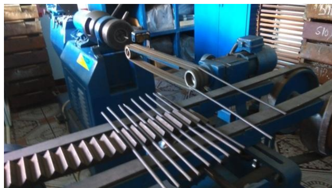
Fig. 1. Production line.

The electrodes type Fe-25%Cr-4%W-V-Ti-La, testing lot, were performed by extrusion, on the production line, presented in figure 1, and having the technological parameters mentioned in table 2.